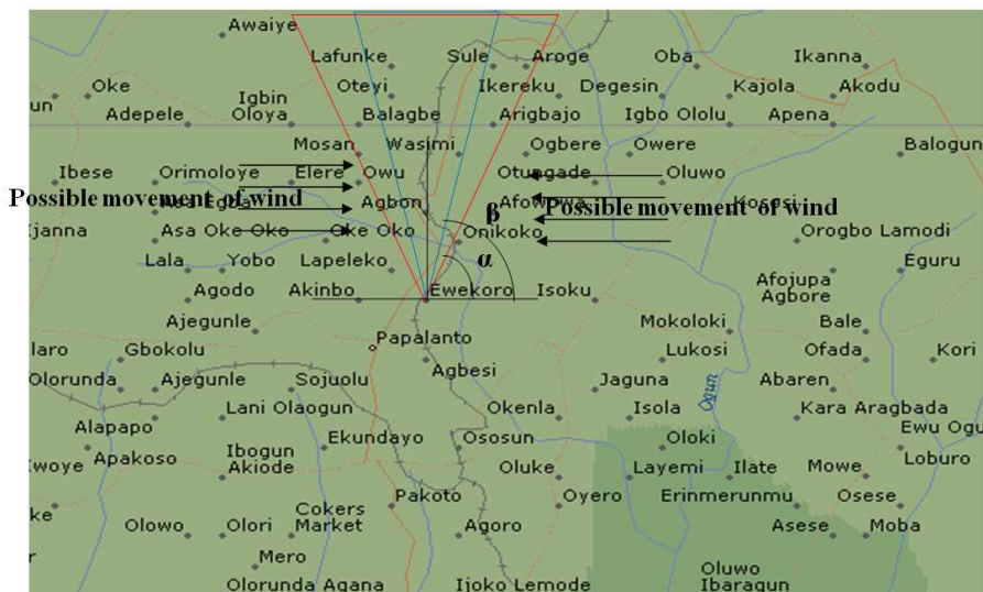
Figure 2. Directional view of air pollutant flow