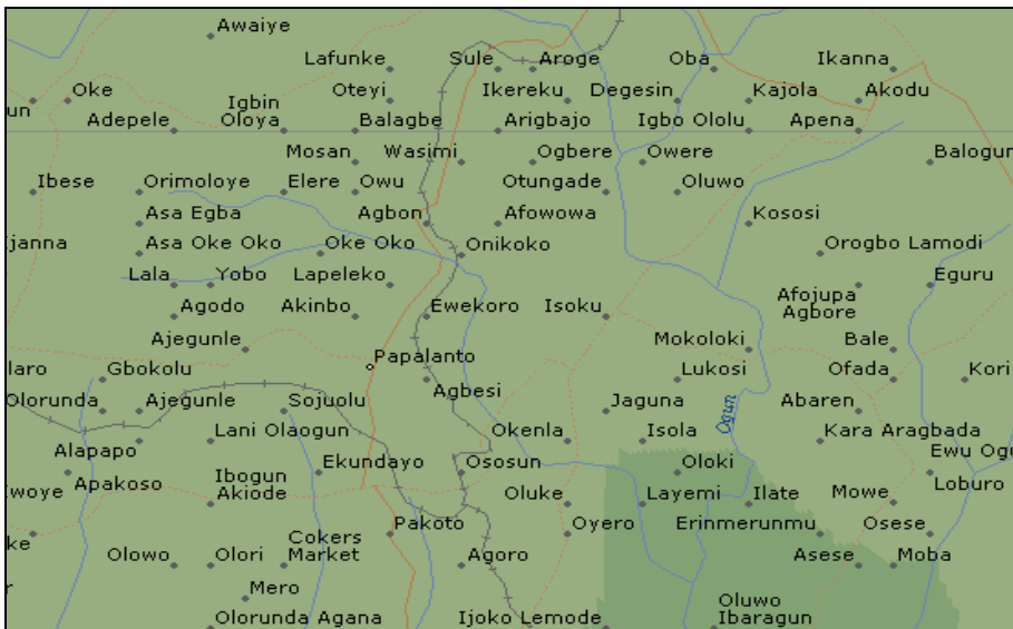
Figure 1. Mapping of Ewekoro and its neighboring towns and villages (Microsoft World Map, 2009)