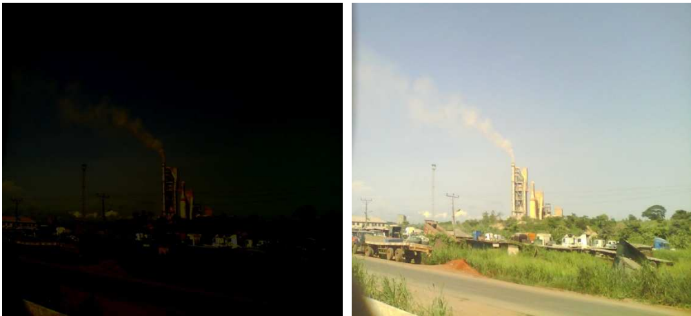
Figure 3. Pictorial view of the movement of the pollutants from the stack at Ewekoro

The second step is to examine a life pictorial view of the model as shown in figure 3 and the theoretical diagram of the Ewekoro cement plant stack as shown below in figure 4. The objective of the pictures is to enable the reader capture the derivation analysis of the advection-diffusion equation from the remodeled Gaussian plume model (Turner, 1994).